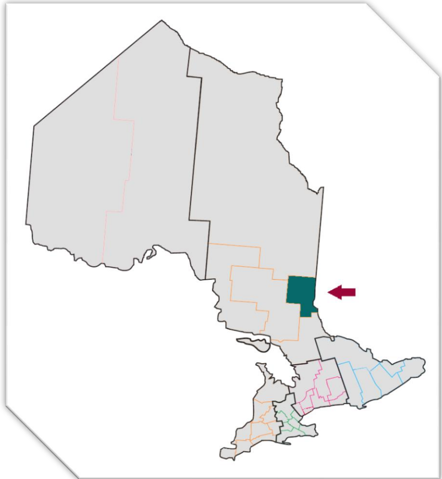
Figure 1: Map of Ontario with Timiskaming Health Unit area boundaries outlined

Timiskaming District townships: Childerhose, Douglas, Doyle, Fripp, Geikie, Hillary, McArthur, McKeown, Musgrove, Pharand and Reynolds (Figure 2). 2